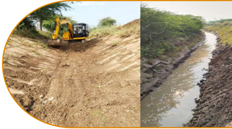
Desilting of GRBC Yadwad water distributional canal III