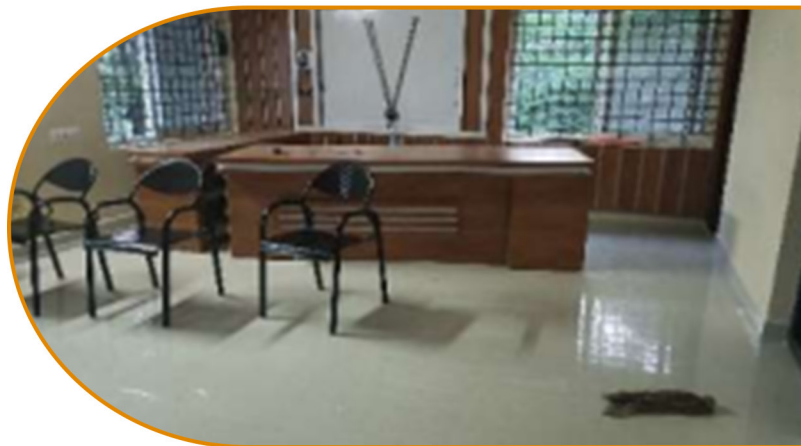
Community Infrastructure Development at Kulagod