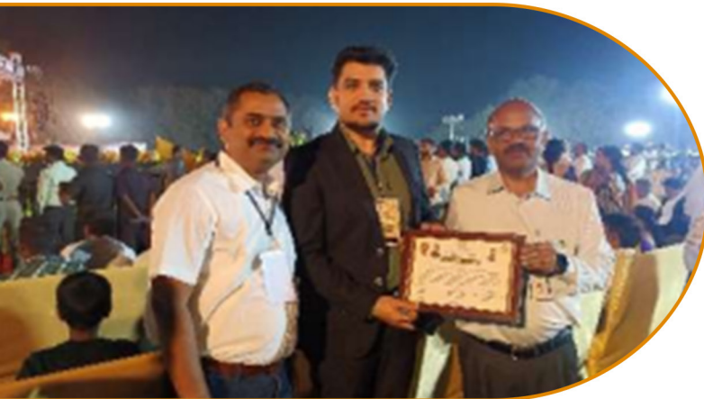
Motorized Tricycle Support