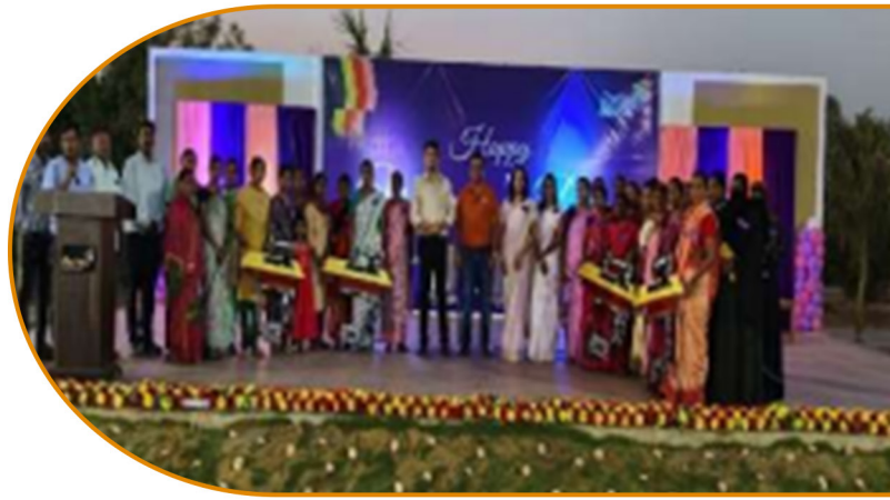
Sewing Machine Distribution