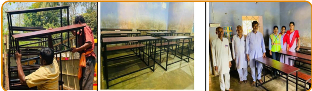
→ 32 Nos. of Bench & Desk are provided to Saraswati Sishu Vidya Mandir, Byree