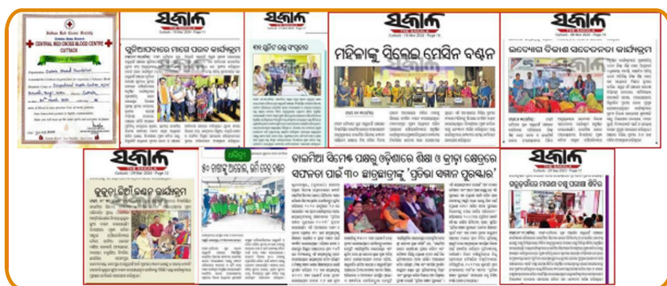
→ MEDIA COVERAGE FY24

Kapilas Cement Manufacturing Work Dalmia Cement Bharat Limited Biswali, Tangi, Cuttack, Pin - 754 082 Odisha