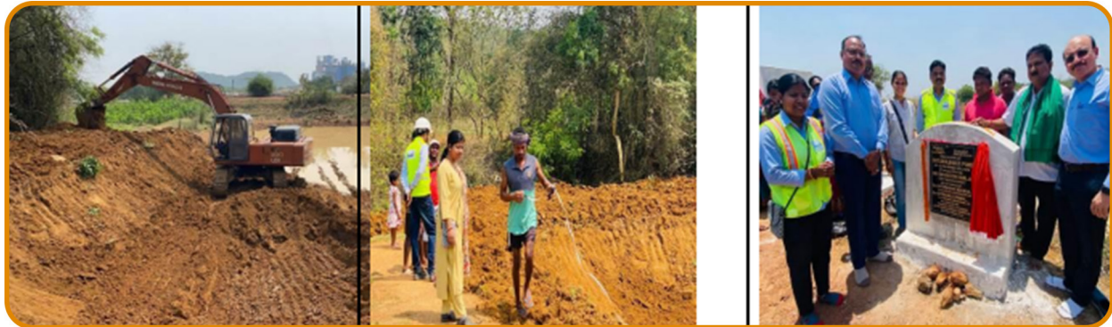
→ Three nos. Community Pond renovation at Suniapada and Bilagadia village benefitting over 600 villagers with water harvesting capacity of 18675 CUM