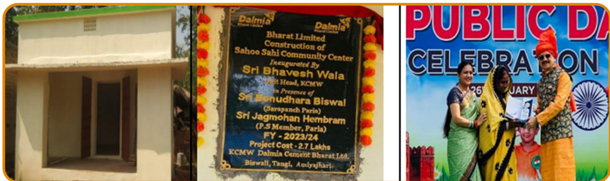
→ Community Centre at Sahu Sahi, Amiyajhari Village → Prativa Samman Award 2024