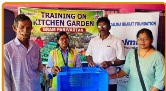
Training On Kitchen Garden