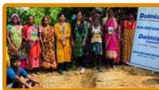
90 farmers are provided with training on vegetable seed bed preparation.