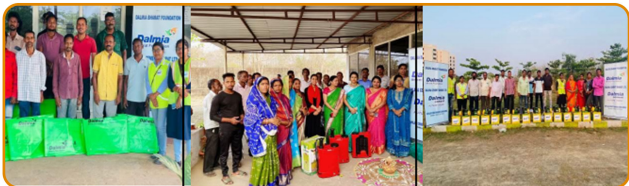
→ Distribution of Azolla Bed, Vermi Bed, Battery Sprayer and 1HP Motor to total 680 beneficiaries