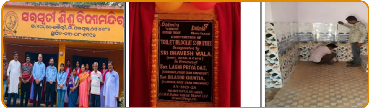
→ Toilet block at Saraswati Sishu Vidya Mandir, Byree benefitting total 292 students