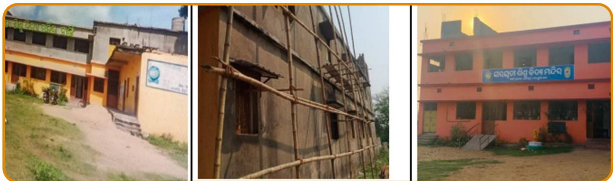
→ Renovation of additional classroom at Saraswati Sishu Vidya Mandir, Tangi