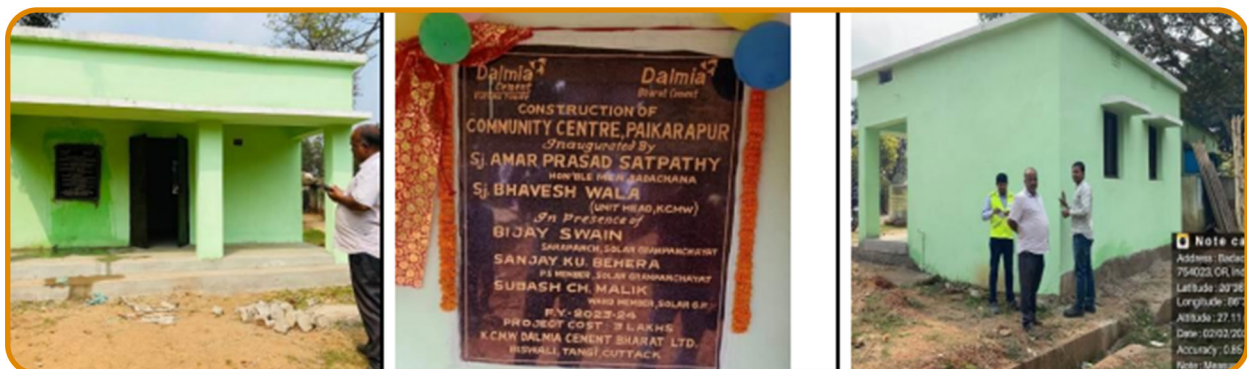
→ Community Center at Paikarapur, Solar GP benefitting over 90 beneficiaries.