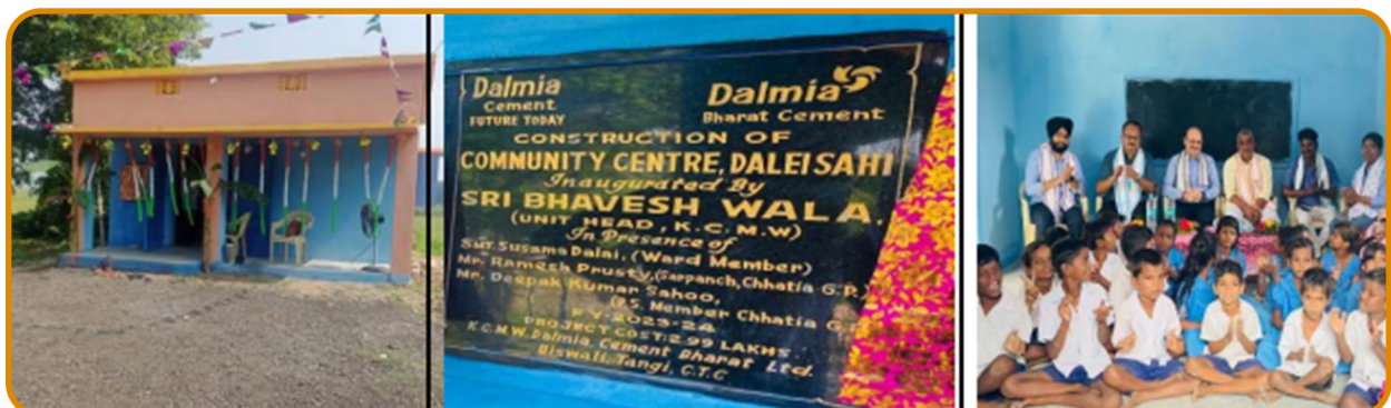
→ Community Centre at Dalei Sahi, Chhatia benefitting 30 children and over 50 youth and women.