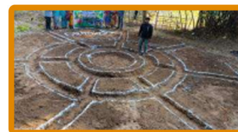
Circular model – Kitchen Garden Demonstration