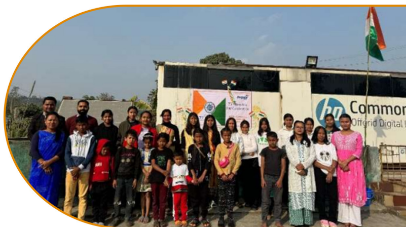
Celebrated Republic Day 2024