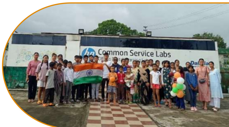
Celebrated Independence Day 2023