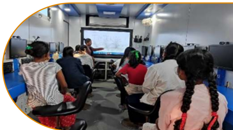
Common Service Lab