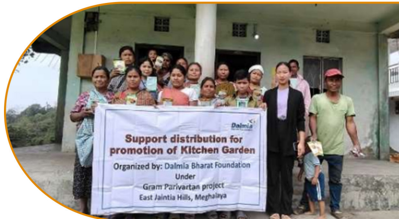
Seeds support for kitchen garden