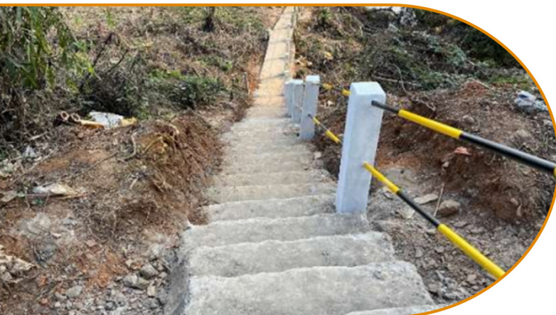
Construction of stairs from NH6 to washing point of Thangskai village