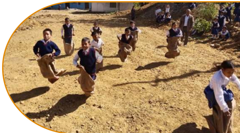
Children's Day Celebration