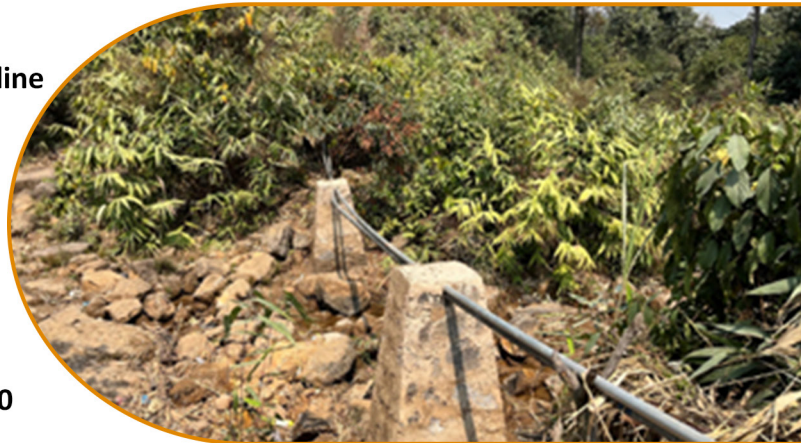
Replacement of drinking water pipeline to Lumshnong village