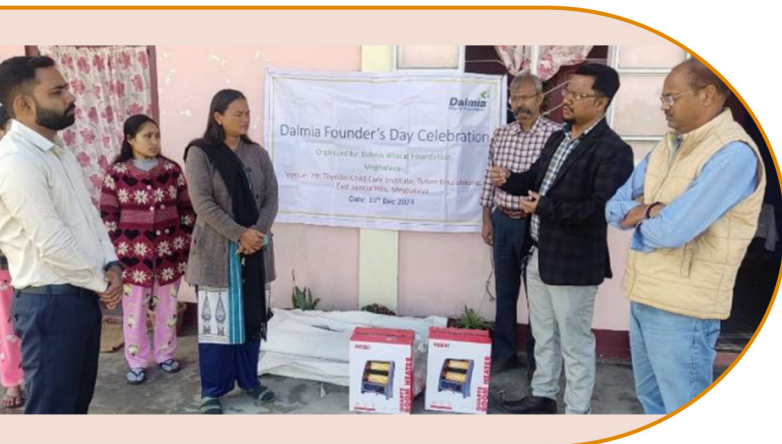
Celebrated Dalmia Founder's Day