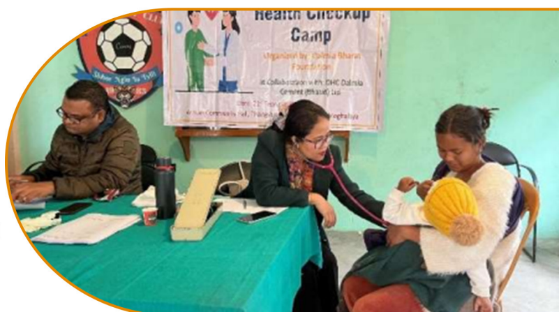
Health Checkup Camp in Thangskai village