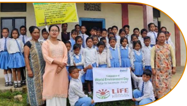
Celebration of World Environment Day