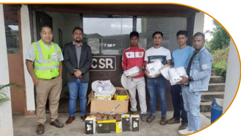
Support of Sports materials to Tiger Sports Club, Thangskai.