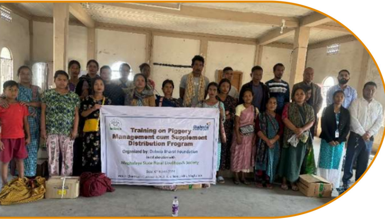
Training and support on piggery farming