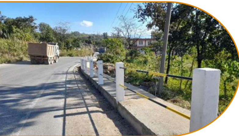
Construction of footpath beside NH 6 in Thangskai village