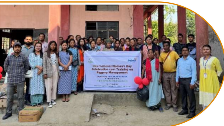
Celebrated International Women's Day 2024