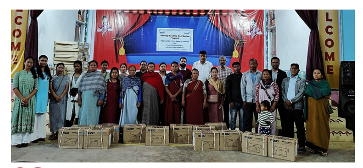
06. Sewing Machine Support