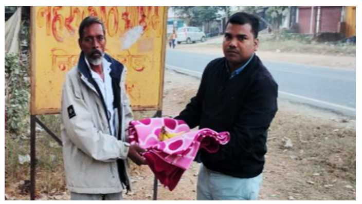
04. Blanket Distribution

Constructed a Bhungroo for water recharge, enabling the replenishment of 120,000 cubic meters of rainwater into the ground.