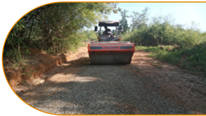
Village road construction