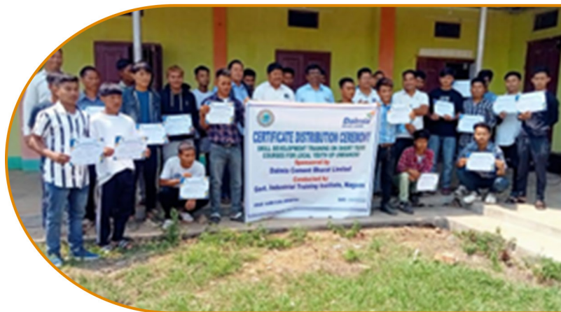
Skill Development Programme