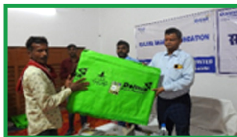
Vermi-bed distribution to farmers by Block Development Officer