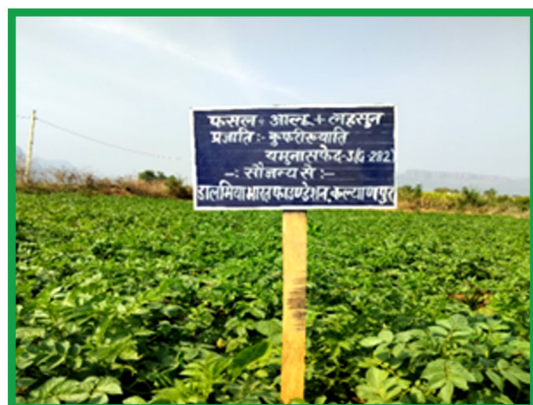
A potato cultivation field promoted by DBF team under high value vegetables cultivation initiative