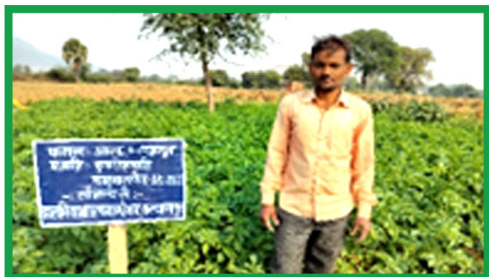
Green Peas Demo Field at Baknaura