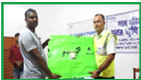
Azolla Bed distribution by Plant HR Head