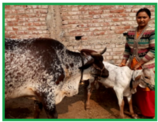
Calf born from artificial insemination initiative