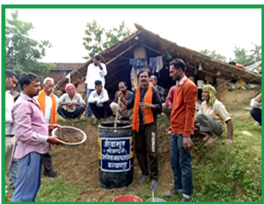
Farmers trained to prepare Jeevamrit for their crops