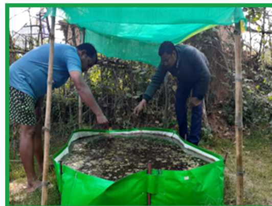
A cattle rearing farmer preparing his azolla bed for his cows