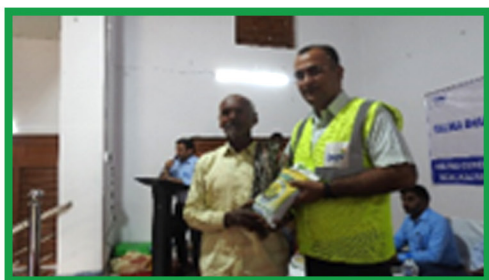
Onion seed distribution by Plant HR head to Banjari Farmers