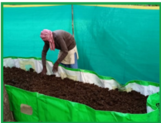
A vermicompost unit being prepared by a farmer in Baknaura village